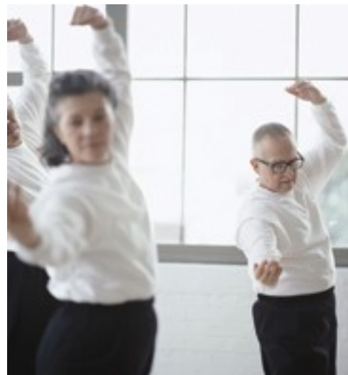
Stretching can slow degenerative arthritis.

If arthritis is slowing you down, get serious with your exercise plan. Consult your physician; work with a professional trainer, physical therapist, yoga instructor, or bodyworker; and start a gentle, progressive exercise program. Your joints will reward you for it, and you'll free yourself from arthritic pain.